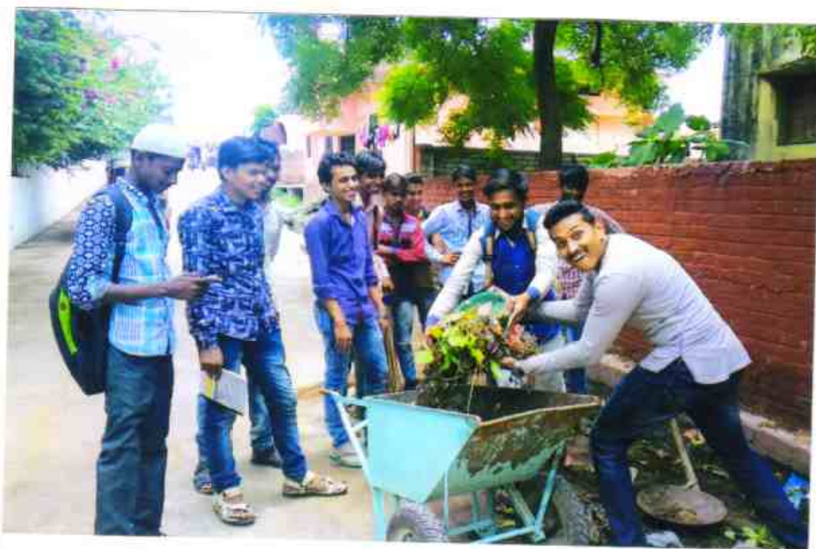
3. Volunteers of Rashtriya Seva Yojana cleaning the premises on August 2, 2017.