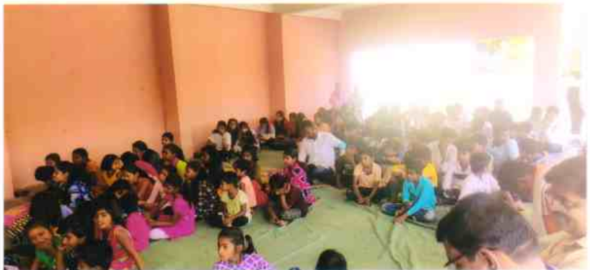
N.S.S. Volunteers present in the inauguration programme on date 22 March 2022.