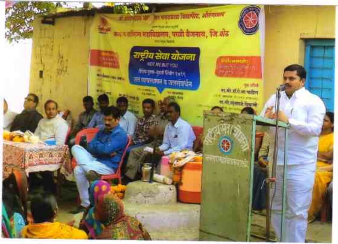
N.S.S. Residential camp organised at Nagpimpri from 16 January to 22 January 2019.