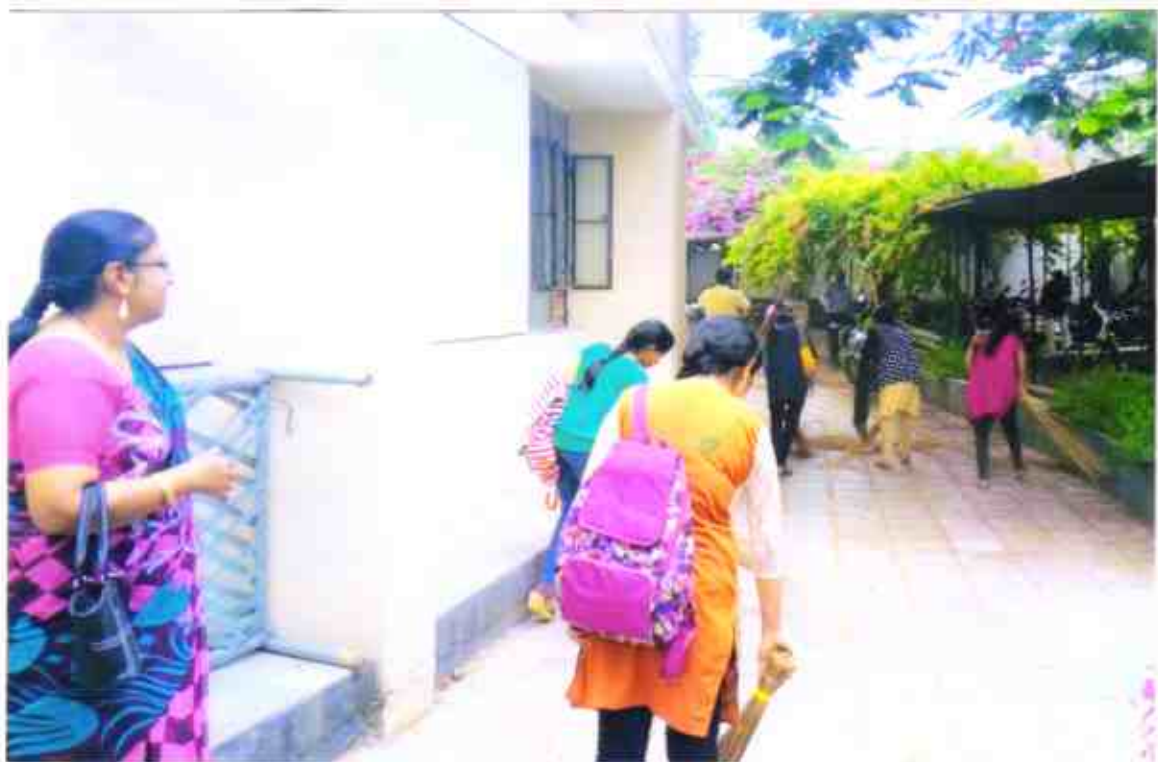
4. On August 3, 2017, the Cleanliness Campaign through the Swachh Premises, Sunder Premises, was organized by the NSS.