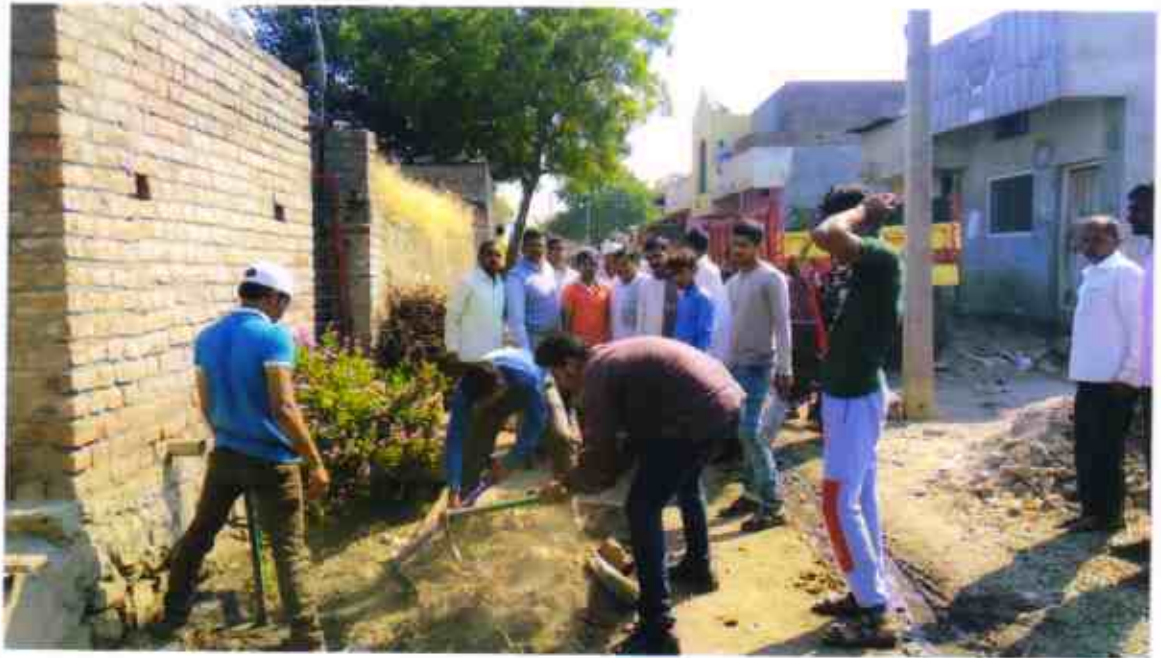
N.S.S. VOLUNTEERS CLEANING THE VILLAGE, NAGPIMPRI.