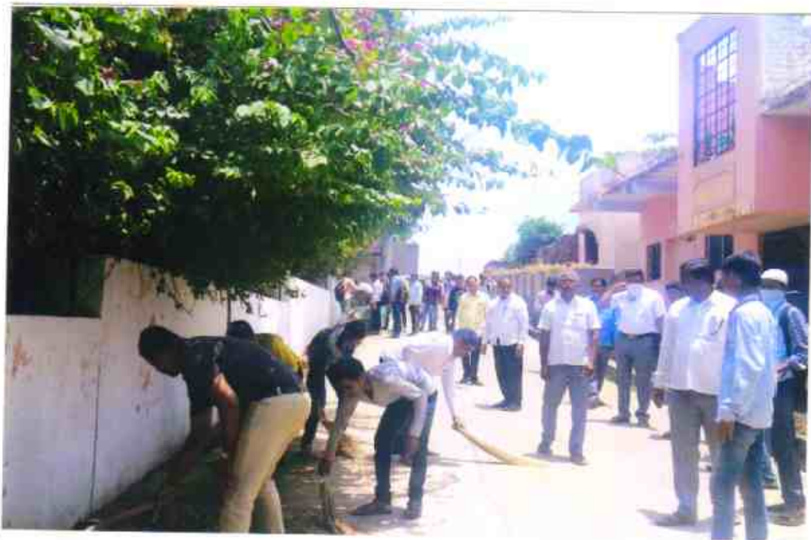
3. On August 2, 2017, while cleaning the area under 'Swachh Bharat Sundar Bharat', Volunteers of NSS.