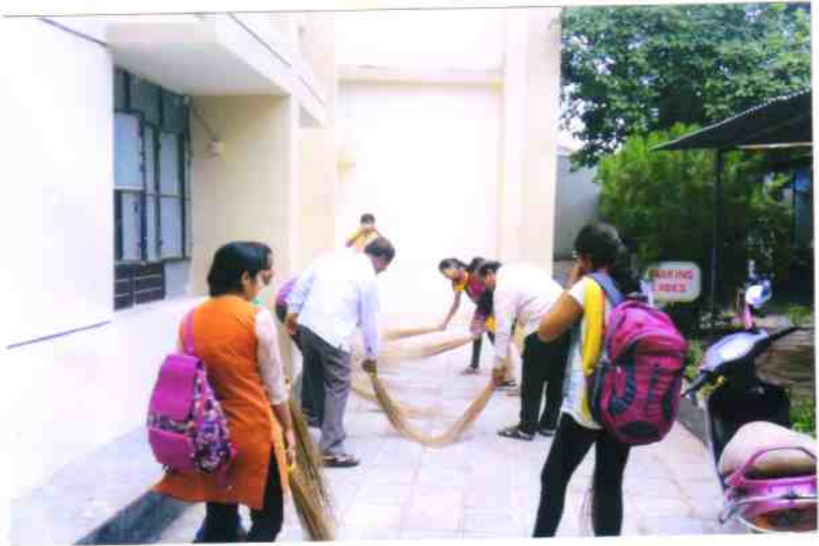
4. On August 3, 2017, NSS student participating in the College Campus Cleanliness Program.