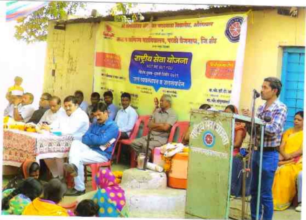
N.S.S. Residential camp organised at Nagpimpri from 16 January to 22 January 2019.