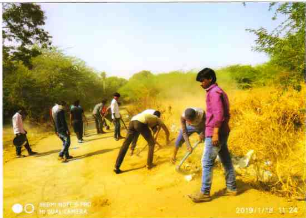
N.S.S. VOLUNTEERS CLEANING THE VILLAGE, NAGPIMPRI.